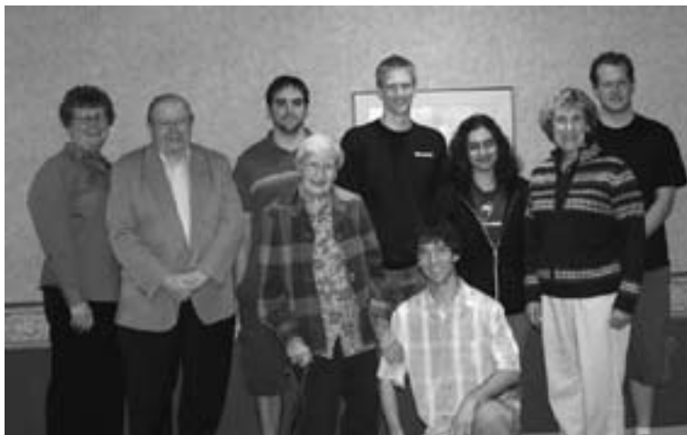
2006 Scholarship Recipients

Department of Physics Kansas State University 116 Cardwell Hall Manhattan, KS 66506-2601 Please include the name of the scholarship fund you wish your donation to go to. More details about scholarships