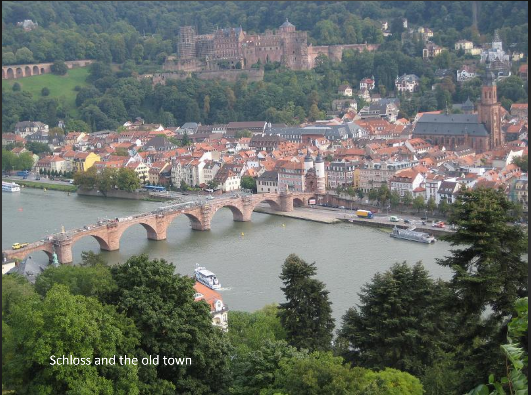
Schloss and the old town