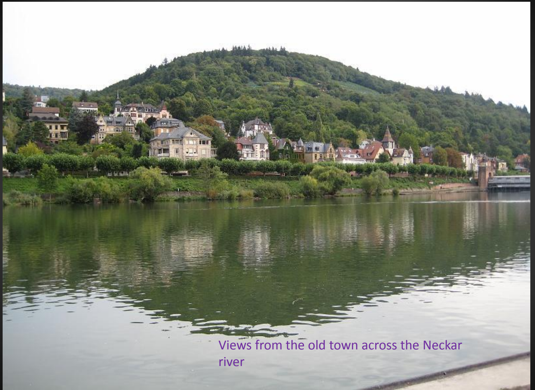
Views from the old town across the Neckar river