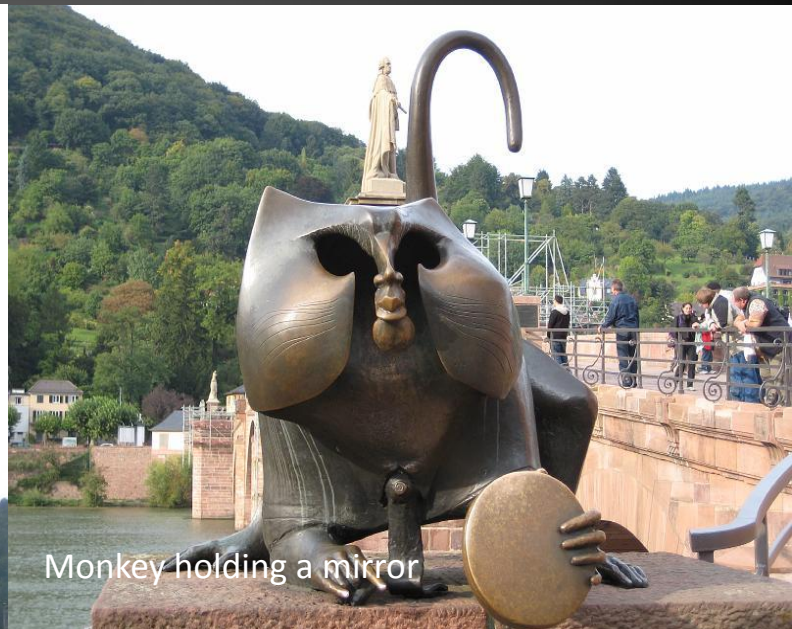
Monkey holding a mirror