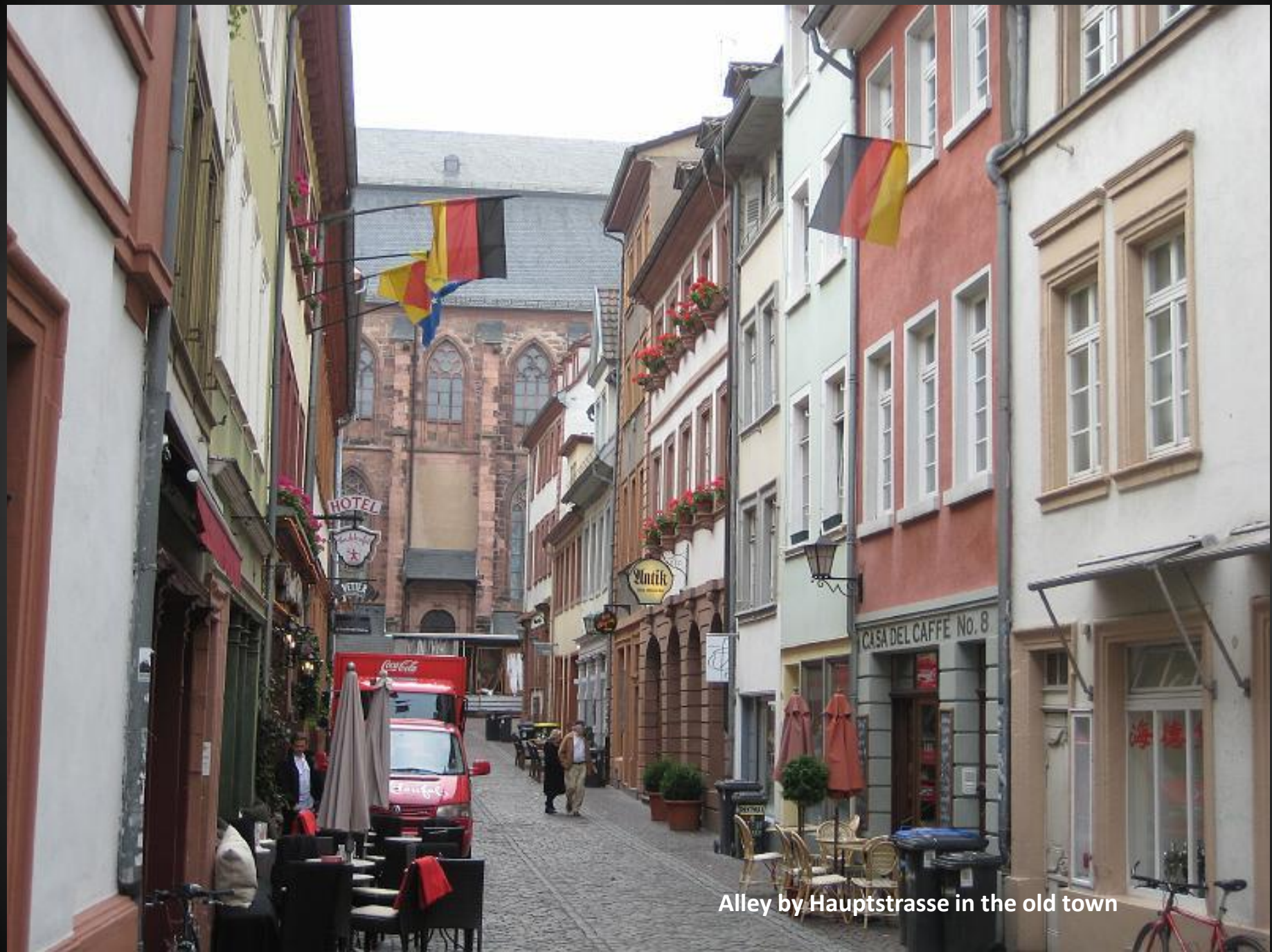
Alley by Hauptstrasse in the old town