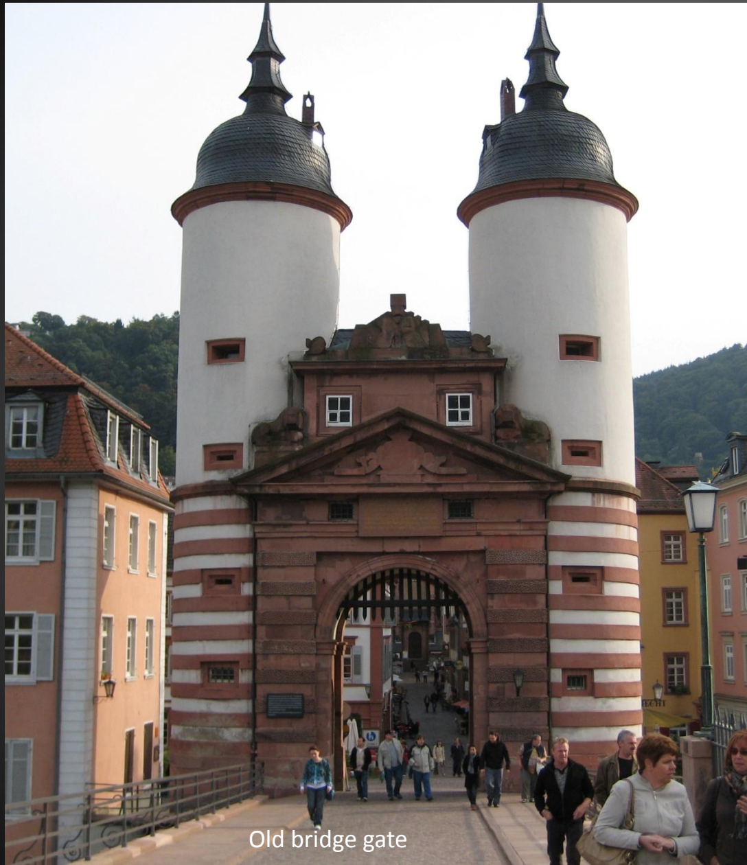
Old bridge gate