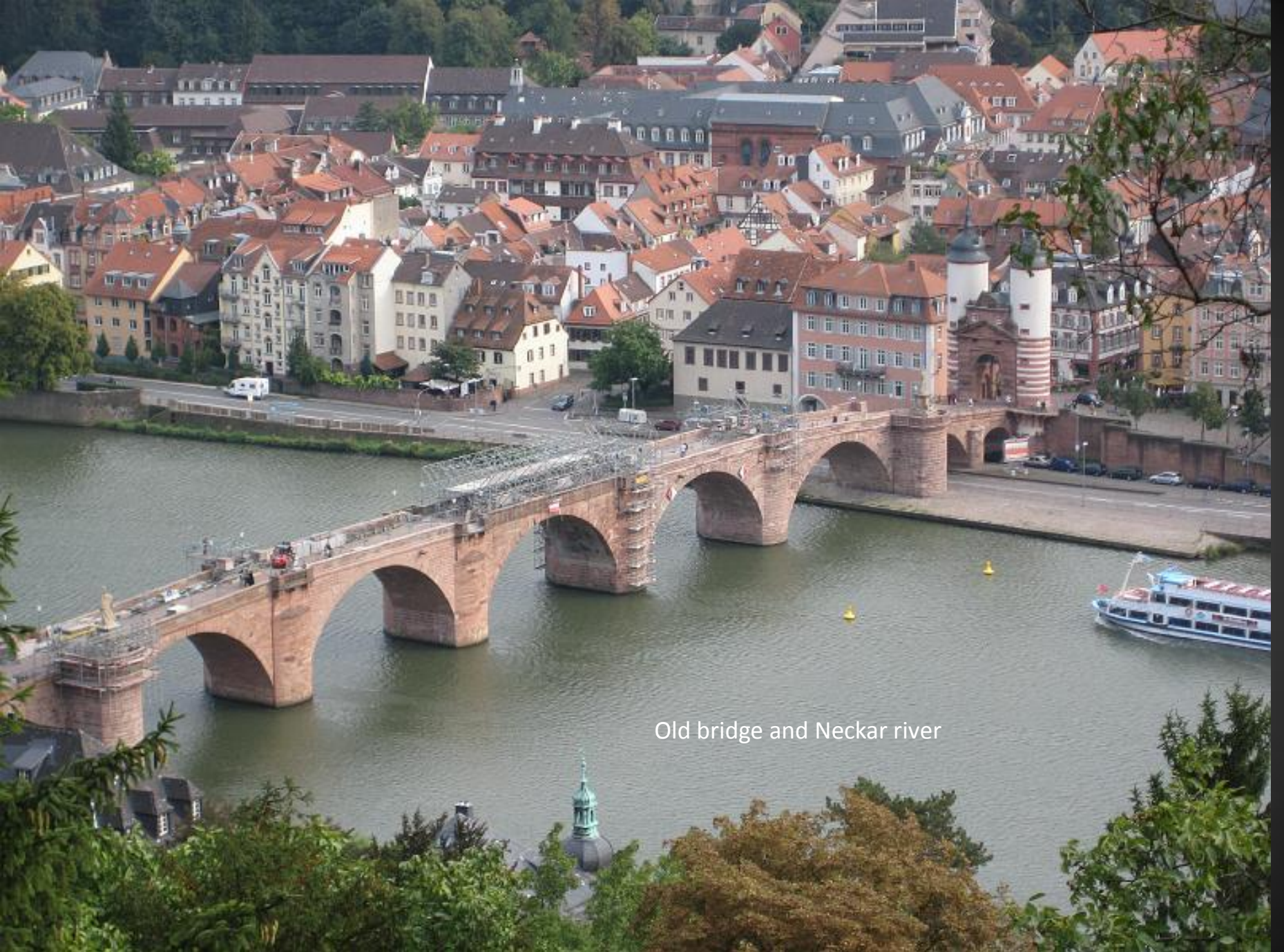
Old bridge and Neckar river