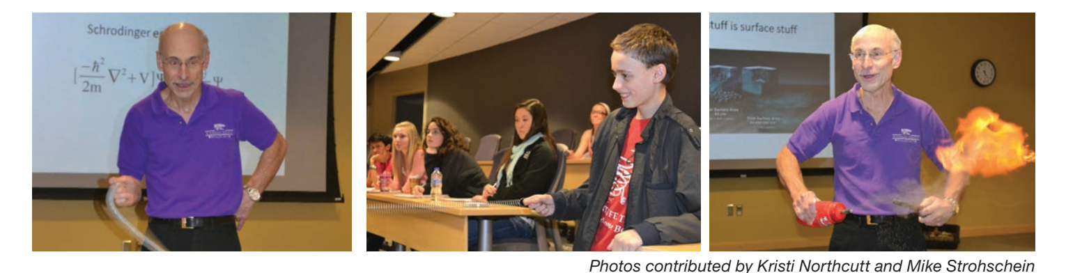
Expanding our community outreach

Our department consistently reaches out to our surrounding community through public lectures, tours of our laboratories, physics shows in area schools, science workshops on campus and our very popular physics show at the university's All-University Open House.